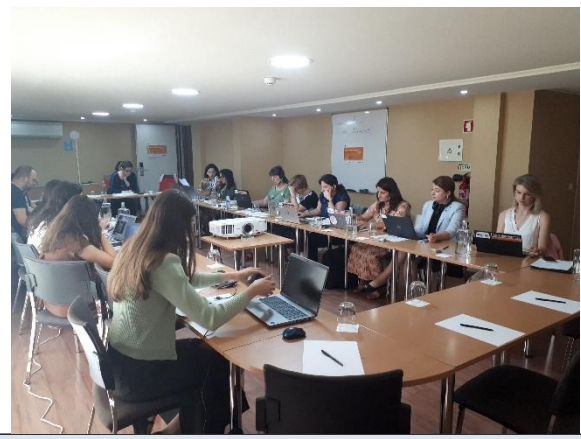
Specific objective 2:

transnational participation in the social protection nexus for families with stay-behind children. Additionally, a presentation on national public support policies in Romanian and Moldovan migrant families examines the delicate interplay between national and transnational welfare policies. Lastly, the discussion on "Adjusting to change: school-related practices and perceptions in Moldovan and Ukrainian transnational families" provides insights into the challenges and adaptations these families undergo within the educational sphere, shedding light on their experiences as they navigate change. Together, these studies contribute to a comprehensive understanding of the nuanced issues faced by transnational families, offering valuable insights for policymakers, researchers, and advocates alike.